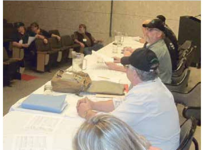
MSTA Annual Meeting