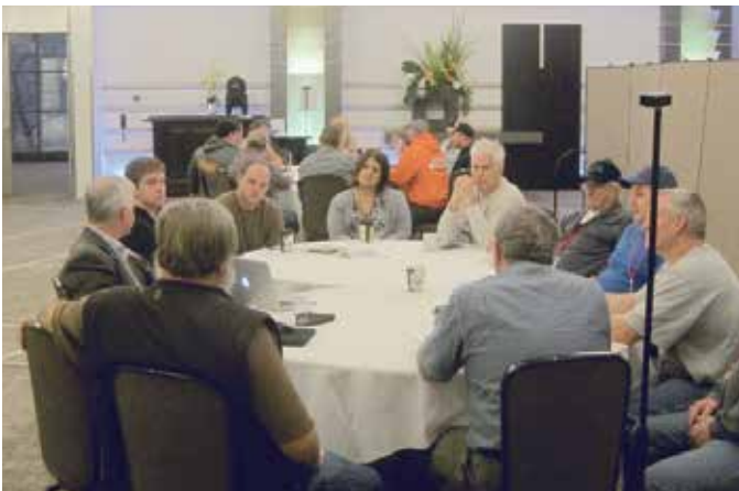
Inventory Management