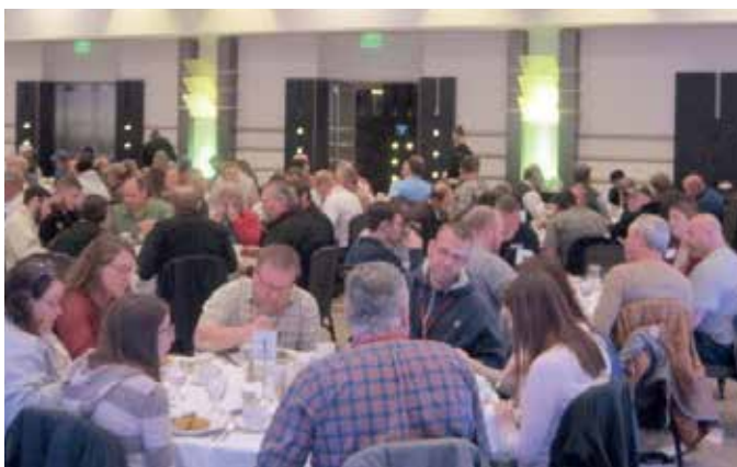
Tuesday Lunch -Big Ten Room

Newsletters – view some past issues of the MSTA Newsletter executiveofficer.msta.biz@gmail.com