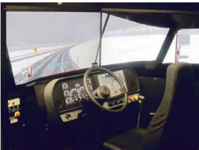
Michigan Truck Safety Simulator