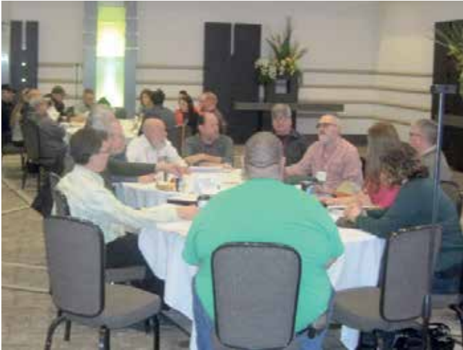
Thursday Round Tables