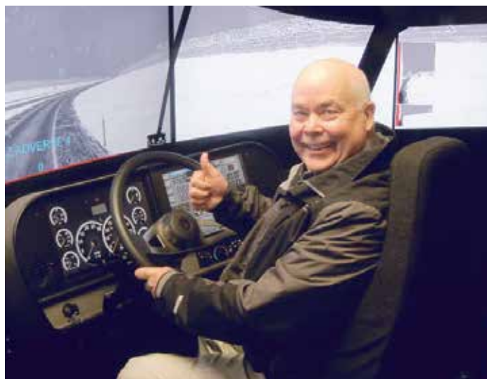
Michigan Truck Safety Simulator Worse Driver "Damn Cab"