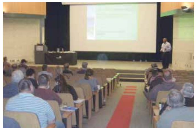
Auditorium - Ebi Burutolu [MDEQ]