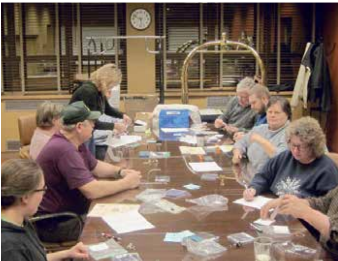
Badge Stuffing Party – Monday Evening