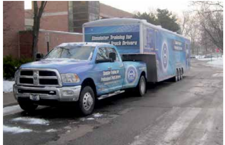
Michigan Truck Safety Simulator