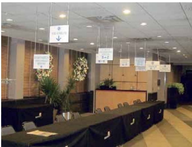
Where is everyone?