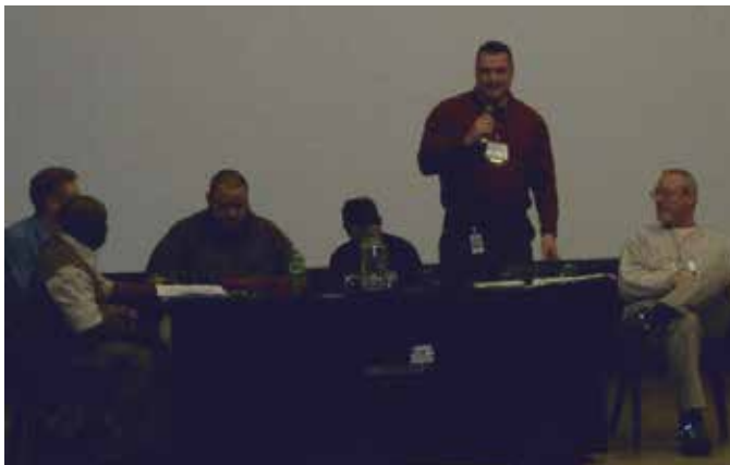
Auditorium - MDEQ Septage Program Staff