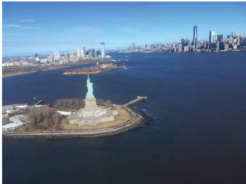
Statue of Liberty with Ellis Island in the background from Kate’s helicopter ride.