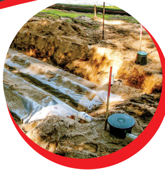
HIGH STRENGTH TREATMENT