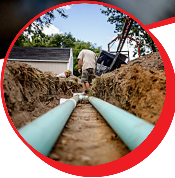
RESIDENTIAL & COMMERCIAL