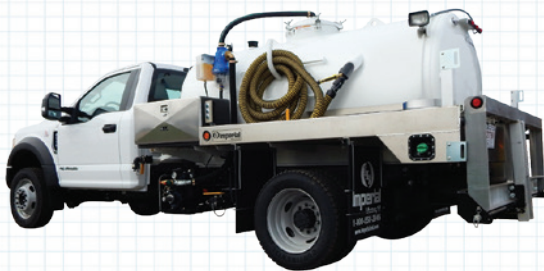
2019 FORD F550 V-10 4X2

350HP CUMMINS ENGINE NVE607 FAN-COOLED 380 CFM PUMP Also available with 2019 Freightliner M2 106 body: $128,641