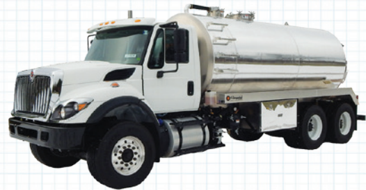
2020 INTERNATIONAL HV 607

CUMMINS ENGINE NVE607-FAN-COOLED 380 CFM PUMP Also available with 2019 Freightliner M2-106 body: $110,900