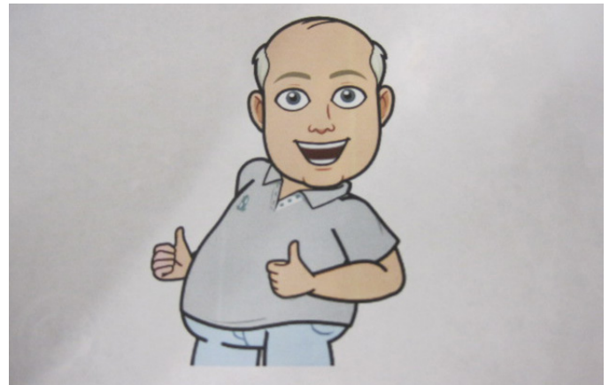
Learning all the "dog gone facts" lol

2530 Xenium Lane N. Minneapolis, MN 55441-3695 1-800-883-1123 | satelliteindustries.com information@satelliteindustries.com