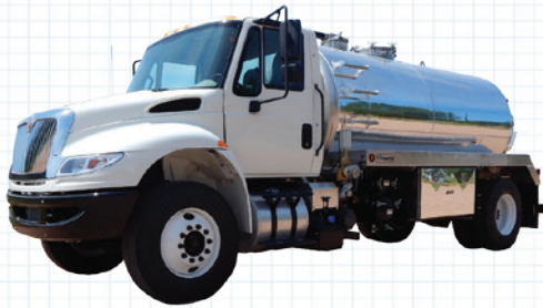
2020 INTERNATIONAL MV 607