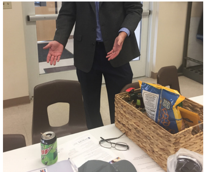
Missing Basket Winner