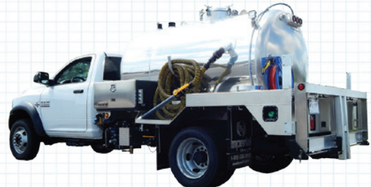
2018 RAM 5500 HEMI 4X2

GAS ENGINE, MASPORT HXL4 160CFM PUMP Also available with diesel engine: $73,791 | Also available on a Ram